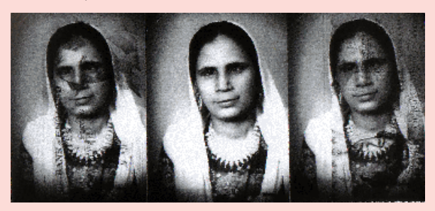
Chila Burman Portrait of My Mother (1995) black and white image of colour original. Cibachrome print.

And Chila continues, in this back and forth: 'and so I was born here.'